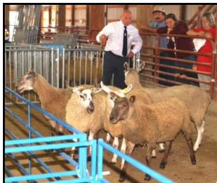
Judging Mule Ewes