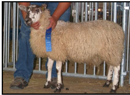
1st prize & Champion Mule Littledale