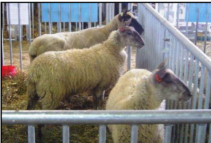
Clun Forest ewe w/ Clun Mule lambs

The North American Mule Sheep Society held its 1st annual "Mule Sheep and Bluefaced Leicester Progeny Show" on September 7th, 2008 in conjunction with the Wisconsin Sheep & Wool Festival in Jefferson, Wisconsin.