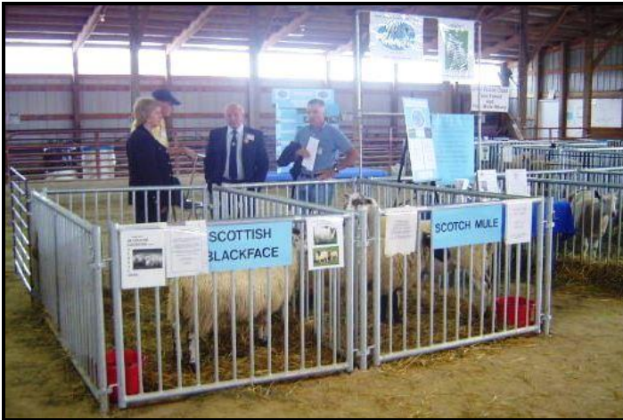
NAMSS Three-Tier sheep breed displays