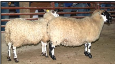
CH Hill Dam w/ Mule Progeny Littledale

Champion Progeny Group- Muleflock, MI Res. CH Progeny Group- Littledale, WI