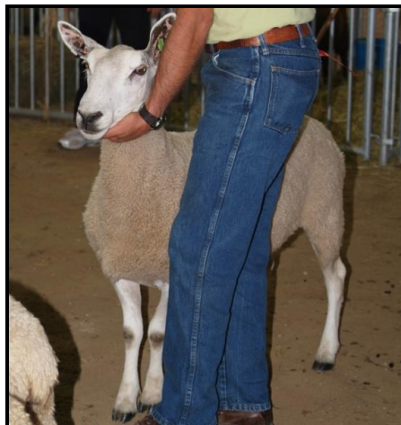
1st prize & Res. CH Mule - Muleflock